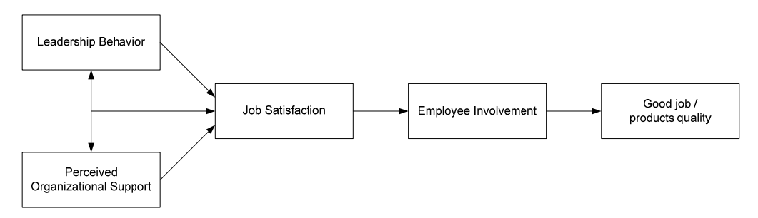
Figure 2. The impact of leadership behaviour and perceived organizational support on product quality (own preparation based on [1])

The aim of the study was to determine whether relationships exist between the level of leadership, the degree of the employee involvement and the level of product quality in enterprises on the assumption shown on figure 2.